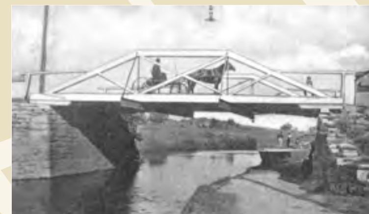
The bridge over the canal at Belvidere Avenue.