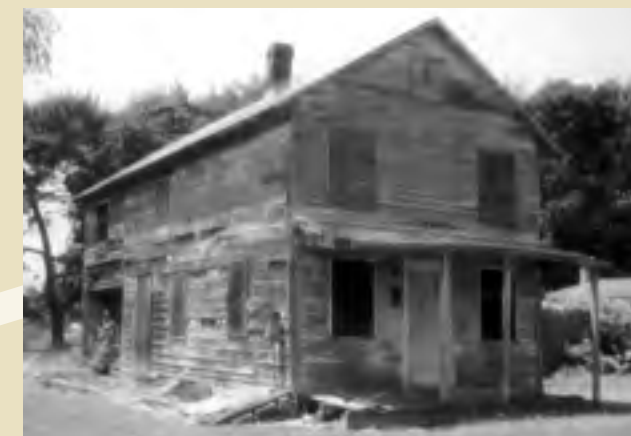
Campbell house waiting to be restored.