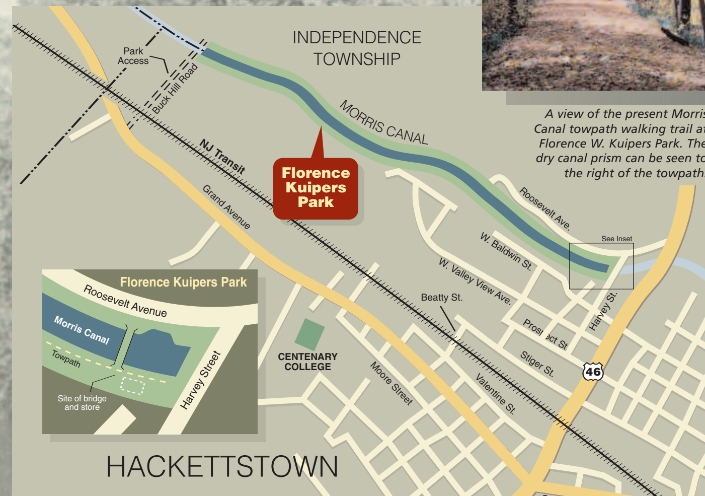
Typical view of the Morris Canal through Hackettstown. This section was part of the 11 mile level from Port Colden to the west to Saxton Falls to the east.