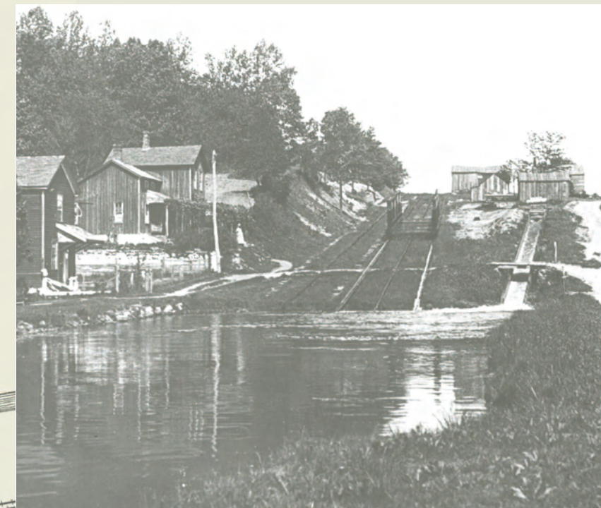
Inclined Plane 6 West and a weigh station are located a short distance to the east, one of only three double tracked planes.