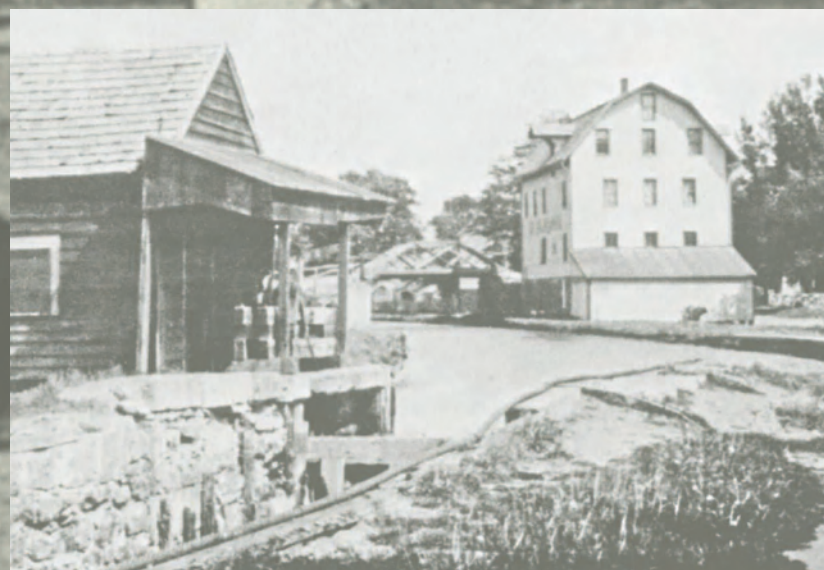
Nunn's store, built circa 1852, was typical of those built near the canal. It was nicknamed "The Wannamaker's of Warren County".

The Port Colden basin was drained in 1924 and later became the site for a new school and playground.