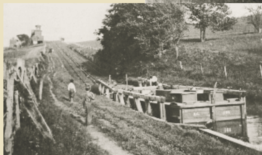
At Inclined Plane 9 West, canal boats were floated onto a cradle car and pulled, by water power, 100 feet up the plane to the next level of the canal.

Today the heritage area along the canal is owned and maintained by Warren County and is open for passive recreation during daylight hours. The Morris Canal Trail follows the canal towpath through parts of the heritage area and is a work-in-progress.