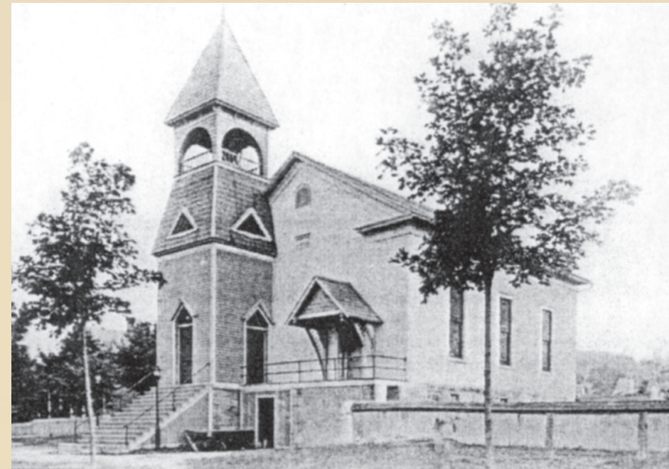
Baptist Church, Port Murray, New Jersey, erected in 1842. Former boatmen are now at rest in the church cemetery overlooking the old canal basin.