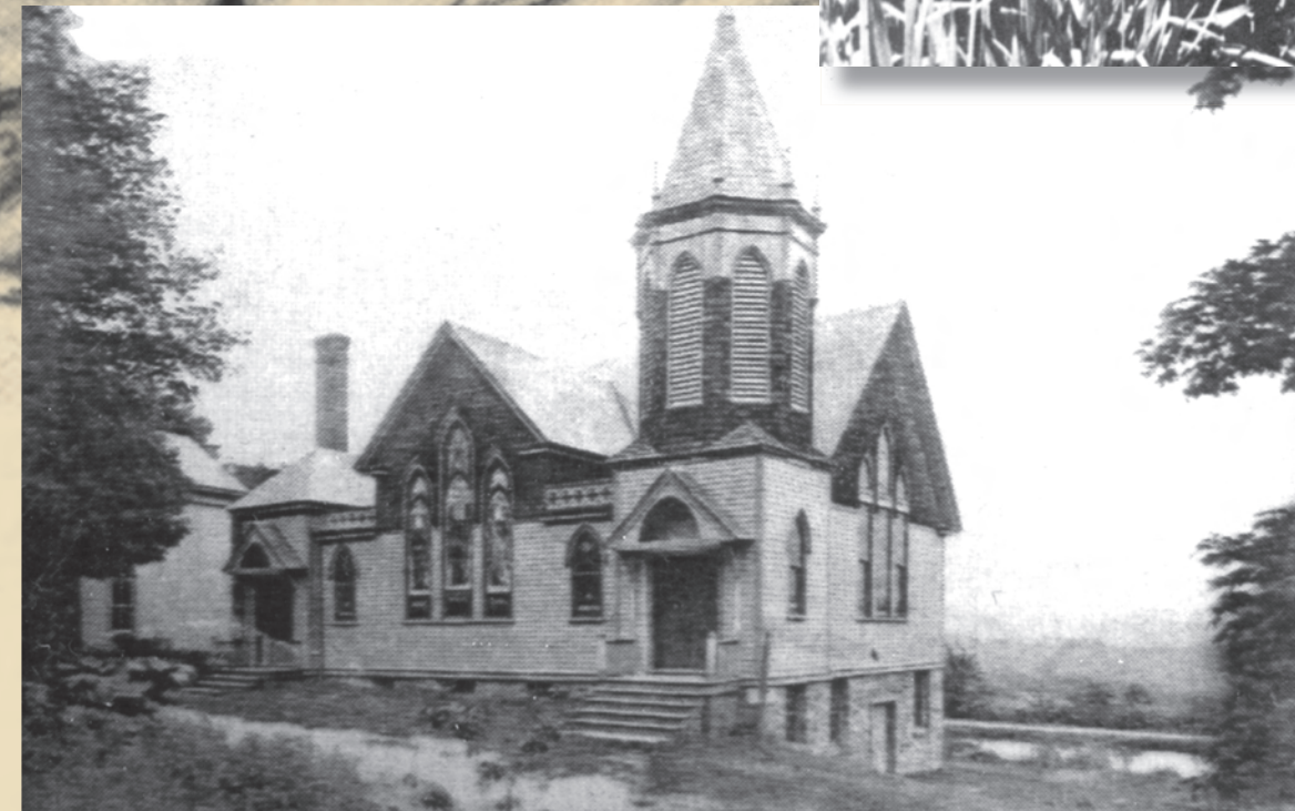
The McCrea Memorial United Methodist Church was built along Main Street in Port Murray. The bustling village was first a port on the Morris Canal and later a stop on the railroad. In this picture the canal can be seen behind the church.