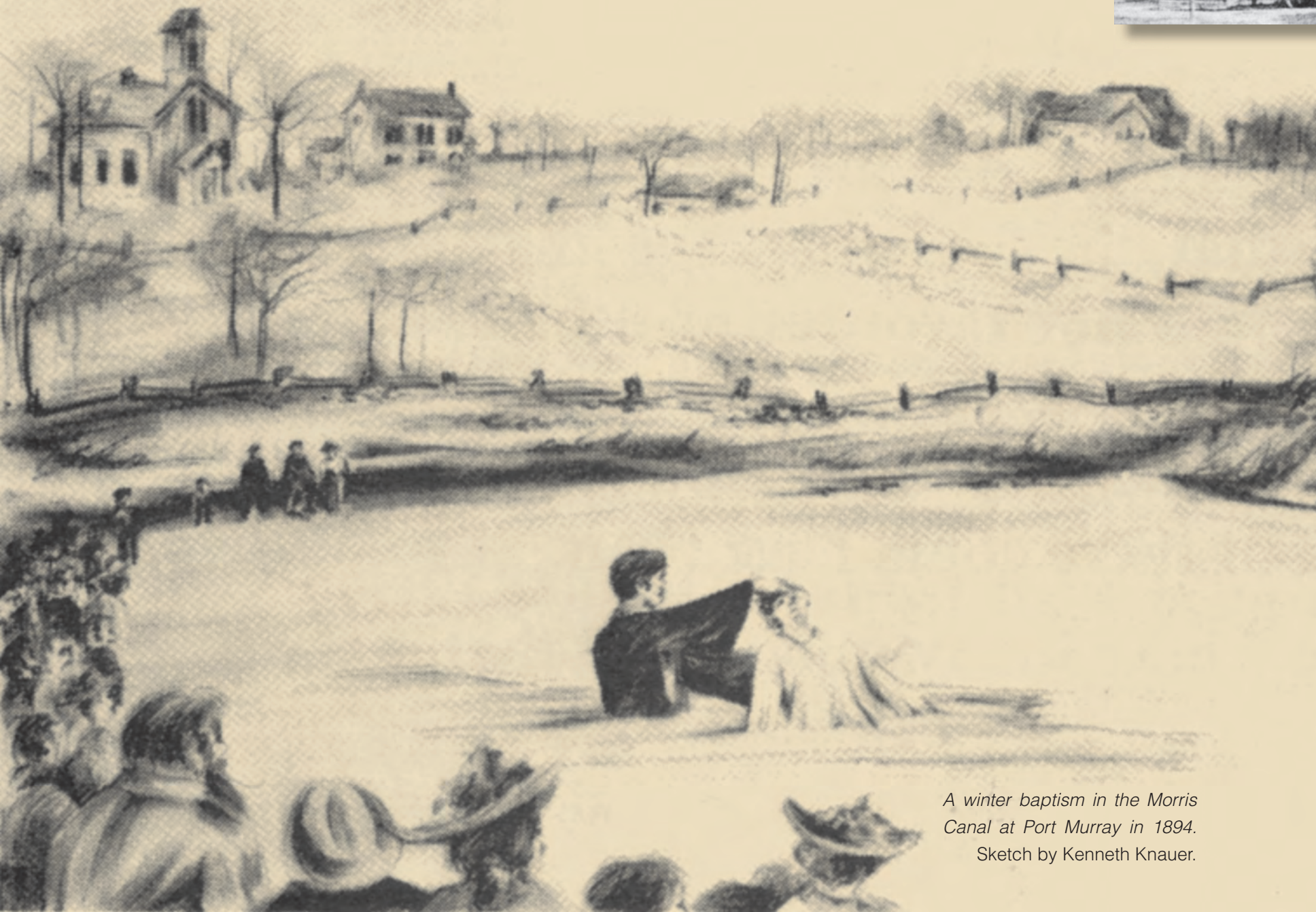
A winter baptism in the Morris Canal at Port Murray in 1894. Sketch by Kenneth Knauer.