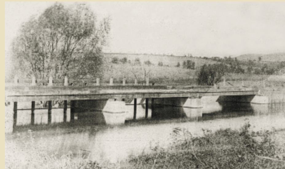
A long bridge carries the canal towpath across the combination overflow-waste weir. The section on the right acted as an overflow allowing excess water to spill back into Lopatcong Creek. In the left background are part of the control mechanisms that operated the waste gates during flooding. At approximately 76 feet, this waste weir was the largest in Warren County.

After the abandonment of the canal in the 1920s, the creek was rechanneled out of the canal bed, leaving the canal unwatered.