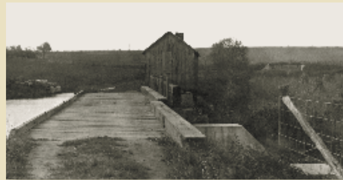
A view looking west down the towpath towards Phillipsburg and across the overflow-waste weir. On the right, in the distance, is the humpback canal bridge over what is now Strykers Road. On the left is a masonry structure where heavy planks could be dropped into a slot acting as a temporary water barrier across the canal prism in case of a break, to drain for maintenance, or to stop navigation at the end of the boating season.

During construction of the canal, Lopatcong Creek was directed into the basin at the bottom of Inclined Plane 9 West where it combined with discharge water from the plane. But because Lopatcong Creek frequently flooded, a small water overflow and a large combined overflow-waste weir were built into the towpath between the bottom of Plane 9 and present day Strykers Road.