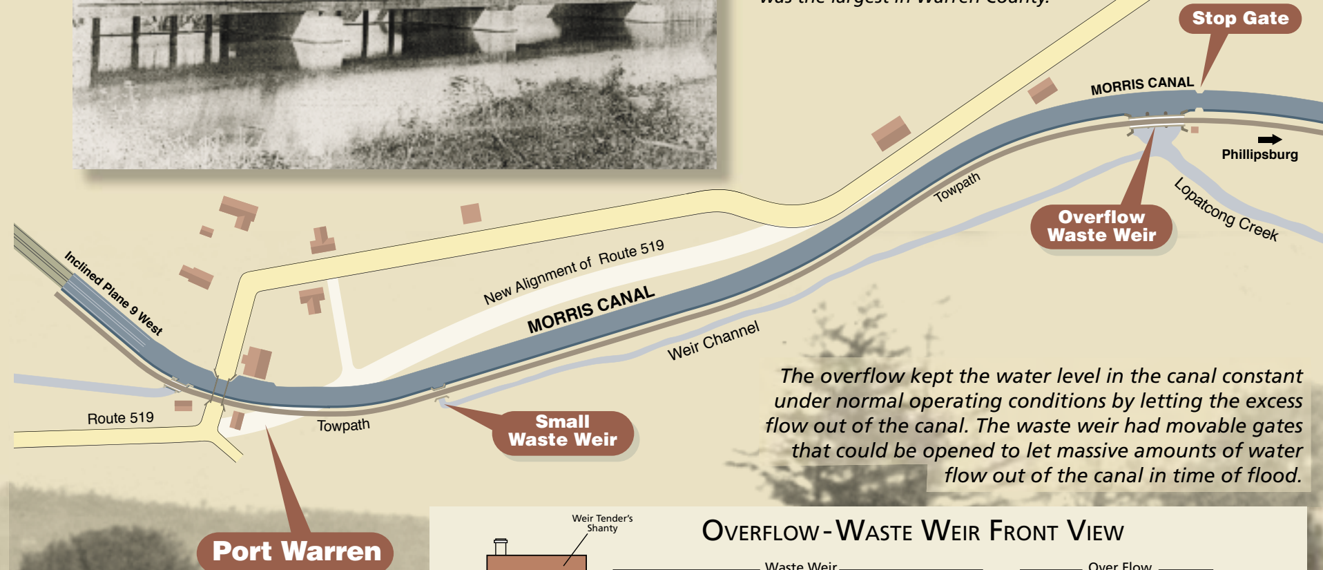
The overflow kept the water level in the canal constant under normal operating conditions by letting the excess flow out of the canal. The waste weir had movable gates that could be opened to let massive amounts of water flow out of the canal in time of flood.